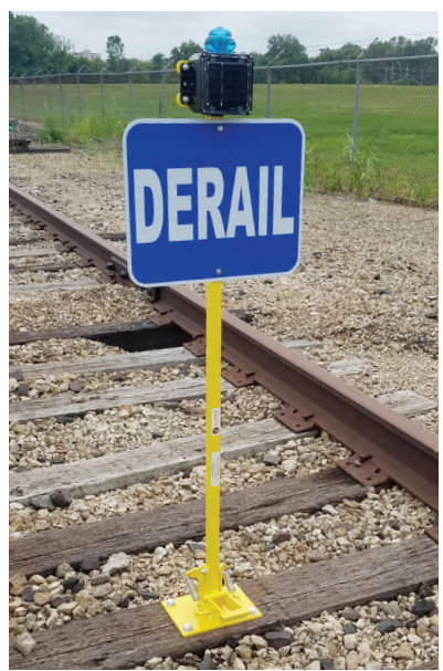
13. A padlock can be applied to the sign holder in both positions.