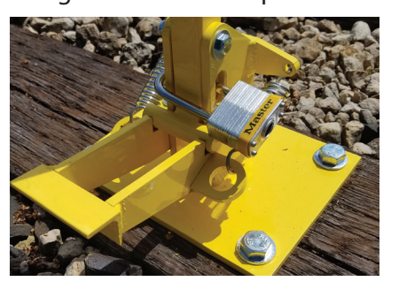
The padlock is being installed on the sign holder with the sign in the active position. Padlocks are sold separately. (4124-164)