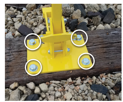
Make sure all four screws are securely fastened so the sign holder can operate properly.