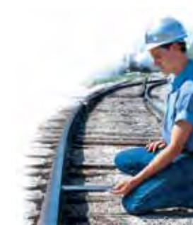
Measure Grades and Curves