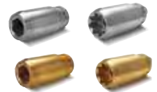
Tank Car Sockets