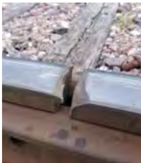
Inspect Your Track