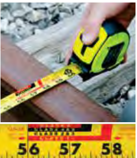
Measure Track Gauge