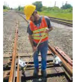
Track Switch Maintenance

Need a source for a product or service we don't offer? We can find one!