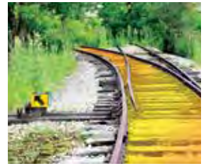
Track Switch Safety