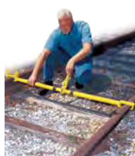
Restore Track Gauge