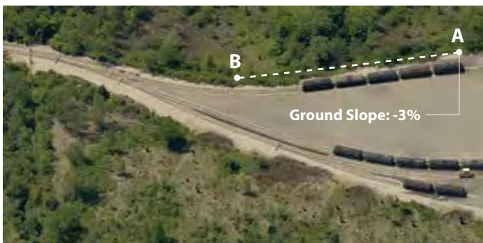
Determine Percent of Track Grade

The capabilities of today’s aerial photography are remarkable.