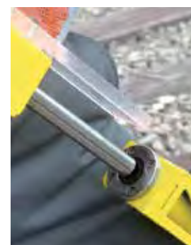
Two-piece assembly features spring-loaded piston for precise gauging.

Rolls through switches and rail crossings without stopping. Continuous gauging with 2" clearance above rail.