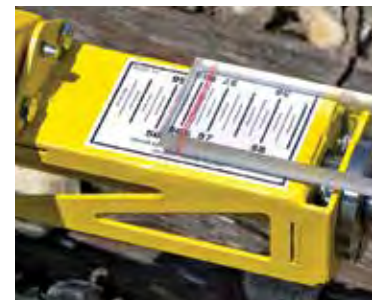
Gauge scale (55.5 - 58.5") can be read through a lexan lens from either side of Roadmaster.