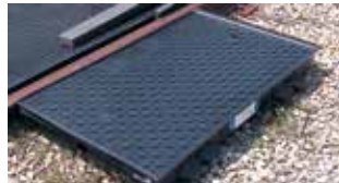
Side Pan Cover 4130-12