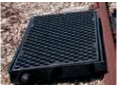
Side Pan Only w/Grate 4130-10