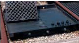
Center Pan with Grates 4130-05