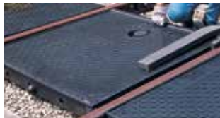
Center Pan Cover 4130-08