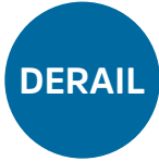
Weight 1.5 lbs. 4015-71 Blue

Reflective 10" diameter round, .080" aluminum Printed on both sides