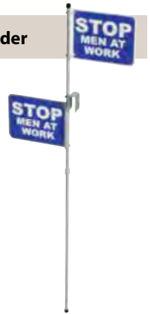
4115-139 Weight 20 lbs.

"STOP MEN AT WORK" (blue) furnished. Specify if another wording is desired.