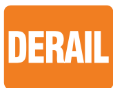
12" x 15" 2 lbs. 6DERAIL-O