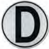
"D" Derail Sign 16" diameter Double-sided Pole mounting Weight 1.5 lbs. 4115-153