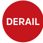
Weight 1.5 lbs. 4015-72 Red